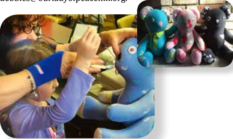
Teddy bears made from the clothing of an Our Lady of Peace patient are a special new offering, thanks to a dedicated team of volunteers.

Interested volunteers who can sew are encouraged to contact Bereavement Services at 651-789-5032 or debbies@ourladyofpeace.org .